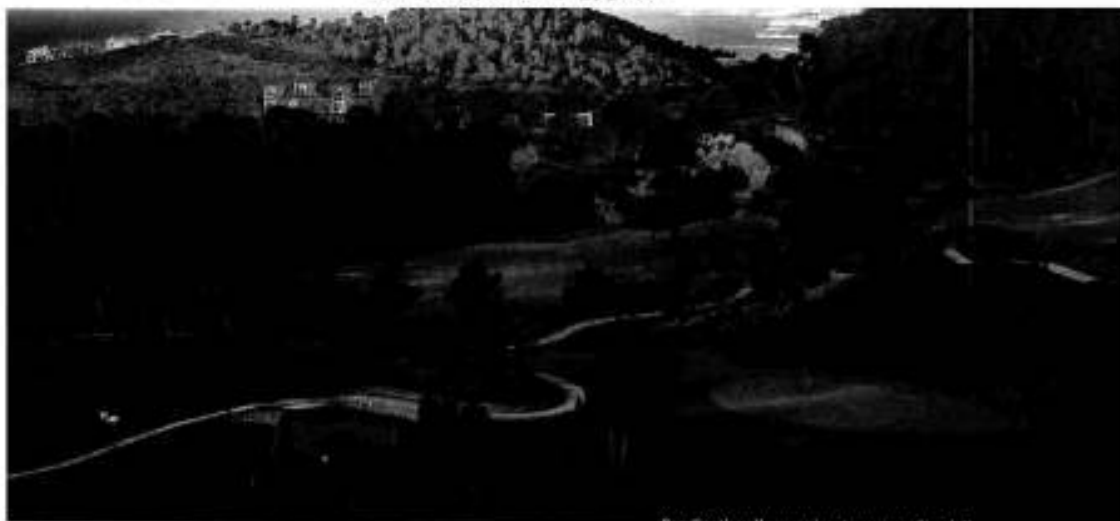
Bendinat's golf course is set among rolling hills

Book tee times in advance, especially in high season (October-March) and do take a handicap certificate. If hiring a car, when you arrive at Palma airport, don't proceed through customs, as hire car companies are situated in the arrivals area. Go straight to the hire car desk if someone can wait to collect your baggage as this will save a lot of time.