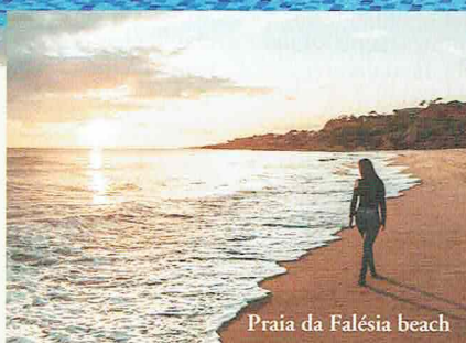
Praia da Falésia beach